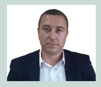
IGOR MICLAUŞ Mayor of Crihana Veche Municipality